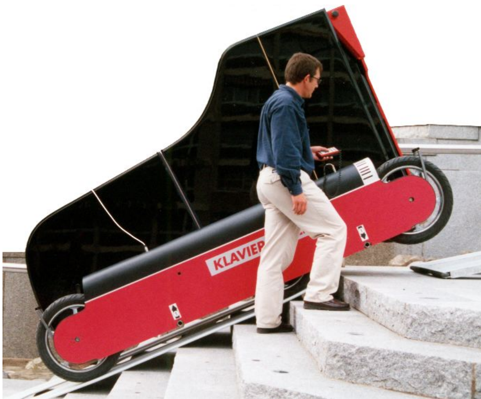
Effortless piano removal in total safety