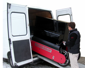
Easy to load in van using aluminium ramp

EU Patent n° 0756841 - US patent n° 0888721