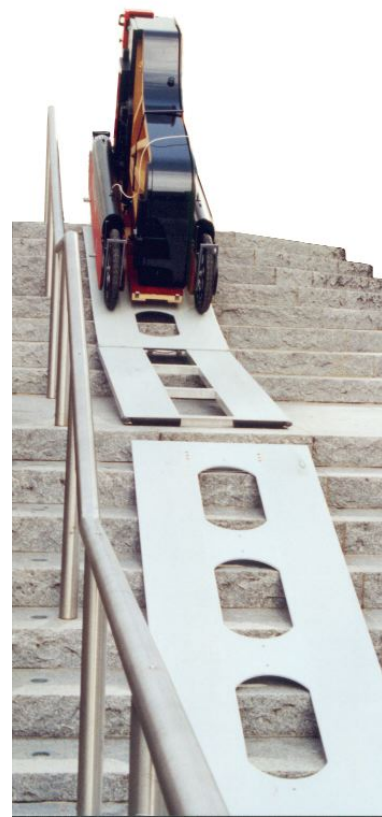
2 wooden boards and one aluminium ramp for climbing any type of staircase